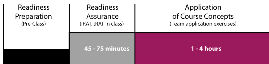
Figure 2: Typical Timeline for a TBL Unit

While most learning occurs amongst students in their teams, faculty are always present and available to provide a “mini-lecture” over material that teams find difficult to master. Traditional exams are also given several times throughout the semester in a TBL course.